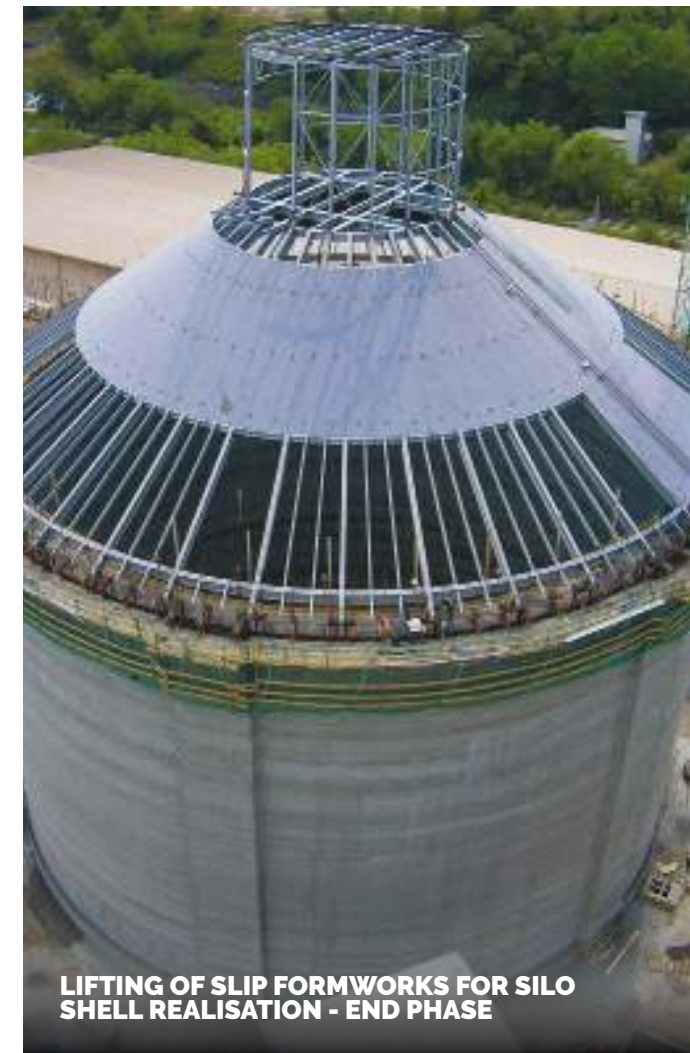
LIFTING OF SLIP FORMWORKS FOR SILO SHELL REALISATION - END PHASE