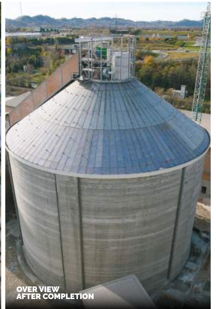
OVER VIEW AFTER COMPLETION