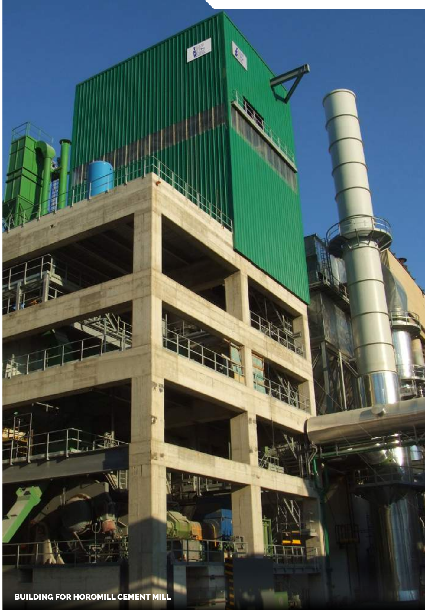
BUILDING FOR HOROMILL CEMENT MILL