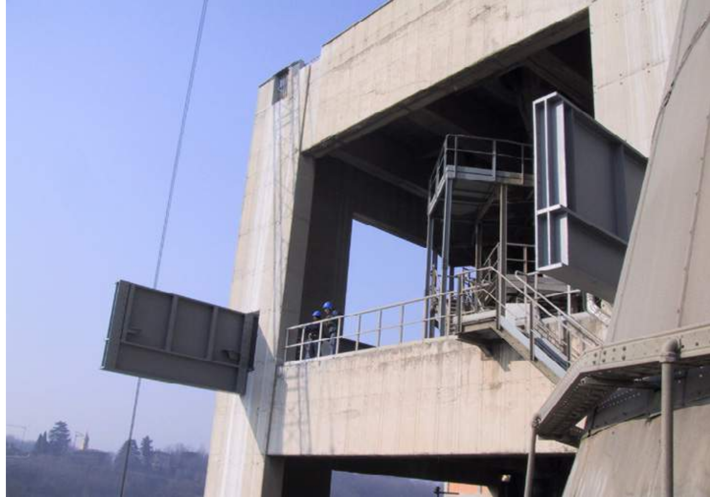
STRUCTURAL REINFORCEMENT OF A PRE-HEATER TOWER